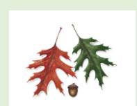
Red Oak "Shumard"