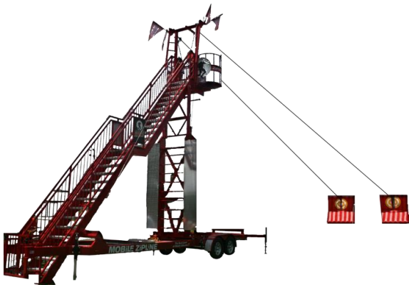
Zip Line – Texas Entertainment Group