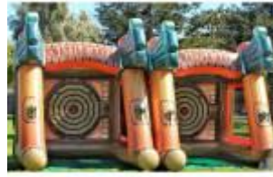
Ax Throwing – Bounce N More