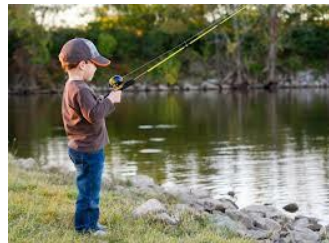
Fishing – HP Anglers?