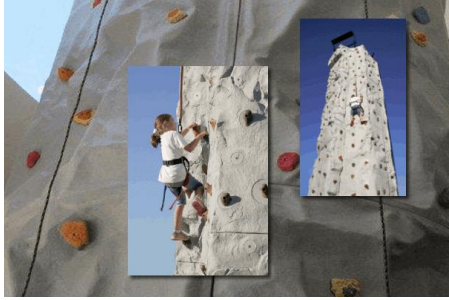
Rock Climbing – Texas Sumo