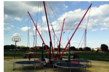
Bungee Trampoline – Texas Sumo