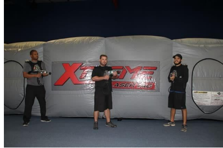
Laser Tag – Texas Sumo