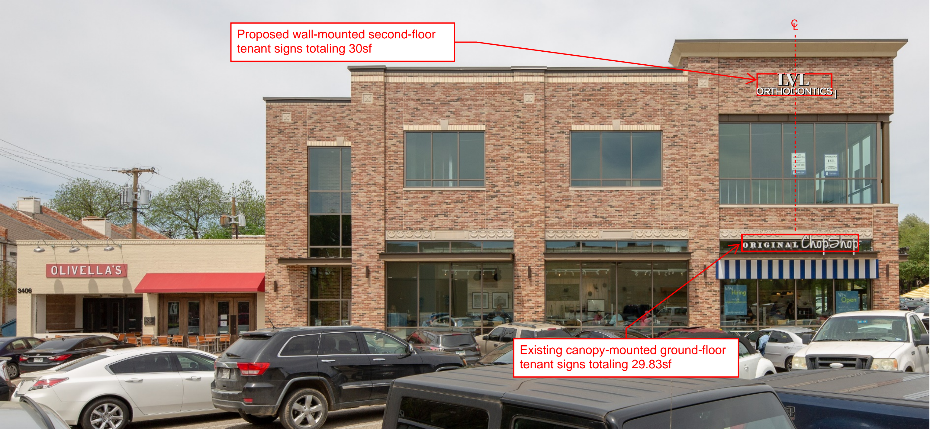
Example of proposed type, style, location, & size of second floor sign (McFarlin)