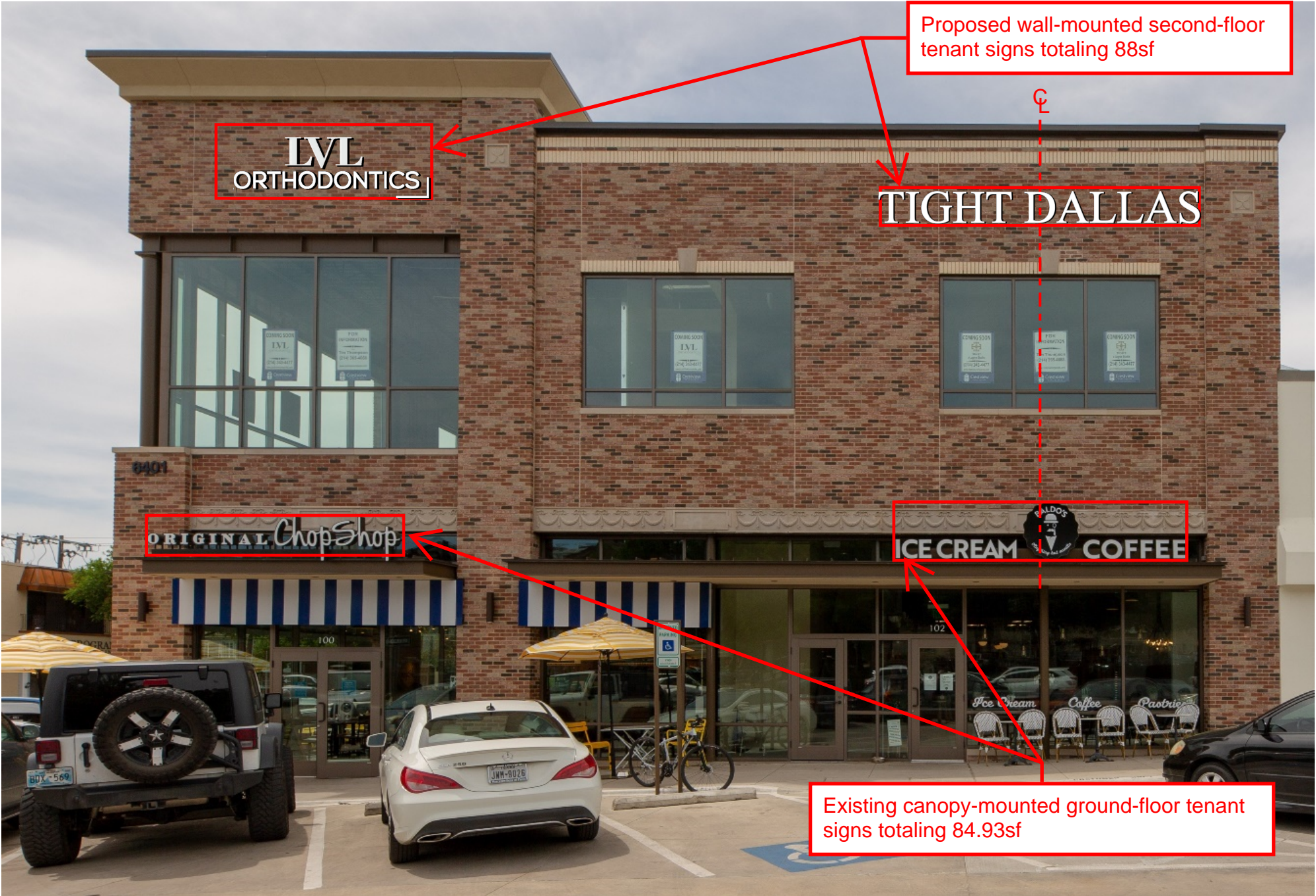
Example of proposed type, style, location, & size of second floor sign (McFarlin)