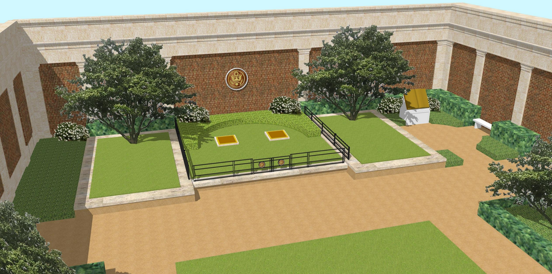
Memorial Terrace and Meditation Court - Birdseye View